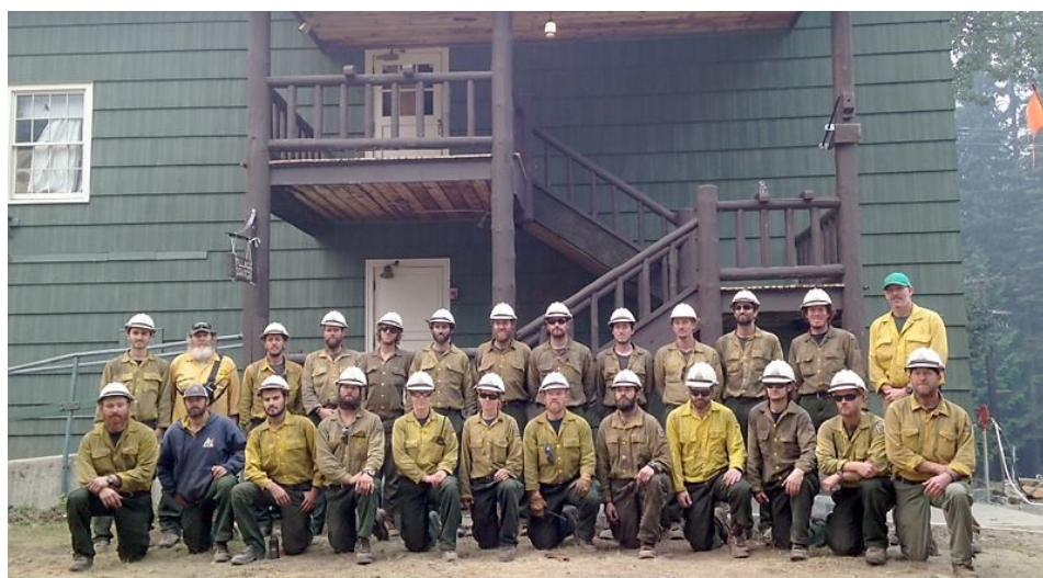
The Hotshot Crew at Holden