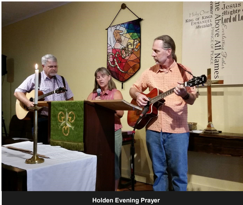
Holden Evening Prayer